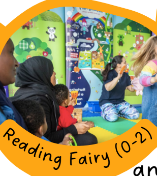
Reading Fairy (0-2)