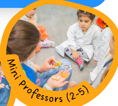
Mini Professors (2-5)