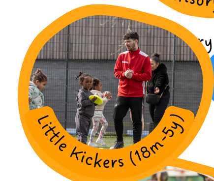
Little Kickers (18m-5y)

Babyzone has lots of classes and activities to join in with, such as...