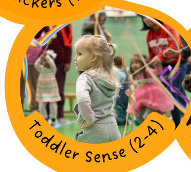
Toddler Sense (2-4)