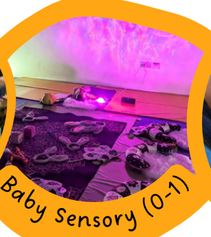
Baby Sensory (0-1)